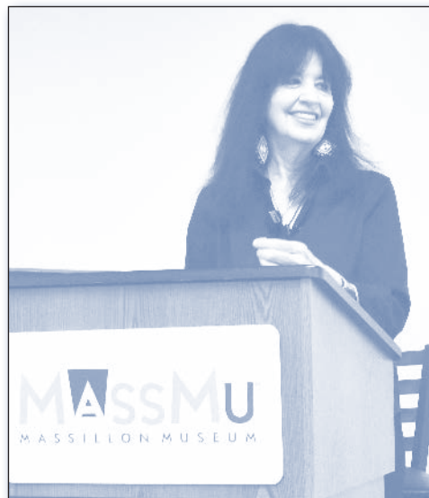
US Poet Laureate Joy Harjo, author of MassMu's 2022 NEA Big Read book, An American Sunrise, presented the Big Read keynote in Gessner Hall on May 5.

MassMu welcomed author Joy Harjo as the in-person keynote speaker on May 5. Harjo also engaged with Honors English students at the Museum during a question-and-answer session earlier that day. More than one hundred Washington High School students read her work in their English classes.