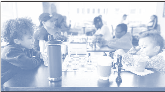
FAR LEFT TOP: The McFee boys enjoyed beverages at one of Greatness Cafe's Sunday chess sessions. ANC